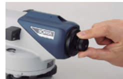
40x Eyepiece EL5 (B20)