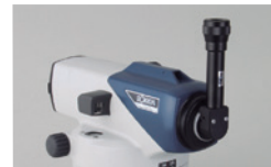
Diagonal Eyepiece DE16 (B20)