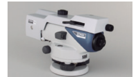
Optical Micrometer OM5 (B20)